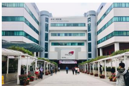
Yeung Kin Man Building (AC1)